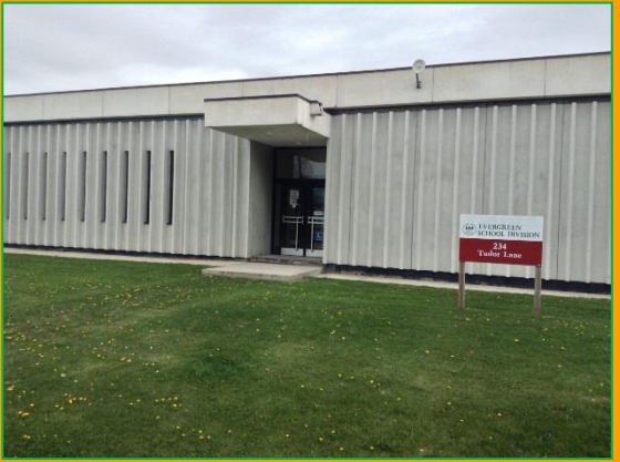
Evergreen Technology and Education Centre